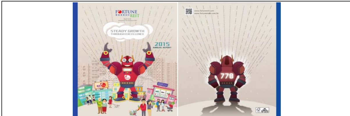
Cover and back cover of Fortune REIT's 2015 Annual Report

Themed "Steady Growth Through Excellence," the 2015 Annual Report successfully emphasizes Fortune REIT's steel-like resilience and perseverance in its business with an eye-catching "Red Fighter" presented on the cover. The "Red Fighter" also precisely conveys the company's determination in driving long-term sustainable growth and delivering steady returns to stakeholders through different economic cycles.